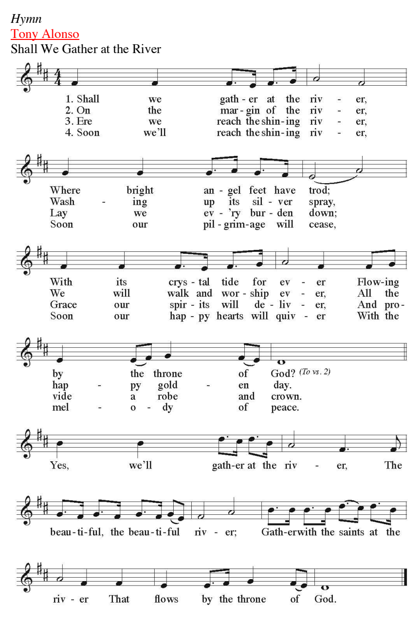
Text: Robert Lowry, 1826–1899 Tune: HANSON PLACE, 8 7 8 7 with refain; 1826–1899