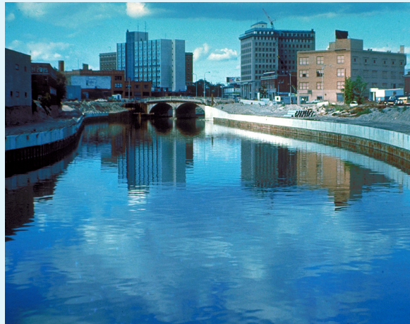
THE FLINT RIVER IN FLINT, MICHIGAN

By then, the damage had already been done. An independent test conducted by researchers from Virginia Tech found lead levels as high as 13,200 parts per billion (ppb) in some homes, enough to categorize it as hazardous waste (Roy). By September 2015, a study from the local Hurley Medical Center found that 2.1 percent of children age five and under had elevated blood lead levels prior to