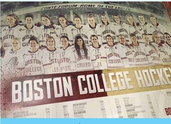
BOSTON COLLEGE WOMEN'S HOCKEY TEAM POSTER

Boutilier and SanGiovanni (1994) examine these differences in BC hockey with a socialist feminist lens that recognizes economic inequality and sexism as significant forms of oppression. BC's two hockey teams play in the same venue and have the same access to equipment, locker rooms, and quality coaches because Title IX requires it, but the differences in times of game, promotion, cost, concessions, and pep are all differences that give unfair treatment by prioritizing the men's team. These differences in opportunity and treatment of the two teams is related to much of the data presented by the National Women's Law Center (2012). More than half of the students at NCAA schools are women, but they receive only 44% of the opportunities. Female athletes at these schools receive only 28% of the total money spent on athletics, 31% of the recruiting dollars, and 42% of the athletic scholarship dol-