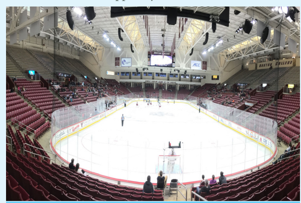
BOSTON COLLEGE WOMEN'S HOCKEY GAME CROWD.

All 19 of the concession stands were open throughout the men's games while the women's games usually offered no concessions, or just one for hot chocolate when it was snowing outside. Social media coverage of the men's games was much more frequent including more action on the JumboTron. Student check-ins on the Gold Pass application were usually over 150 for the men's games and under 25 for the women's games. Crowds for the men's game were often made up of both students and families, but the women's games were mostly families with young girls, potential hockey players themselves who might look up to the BC players. The emotion and intensity during sporting events with larger crowds is palpable and further influences even more people to attend. Players are also likely to feed off this energy, so the women's games that have hardly anyone in the crowd do not appear as inviting and do not act as a support system for the women.