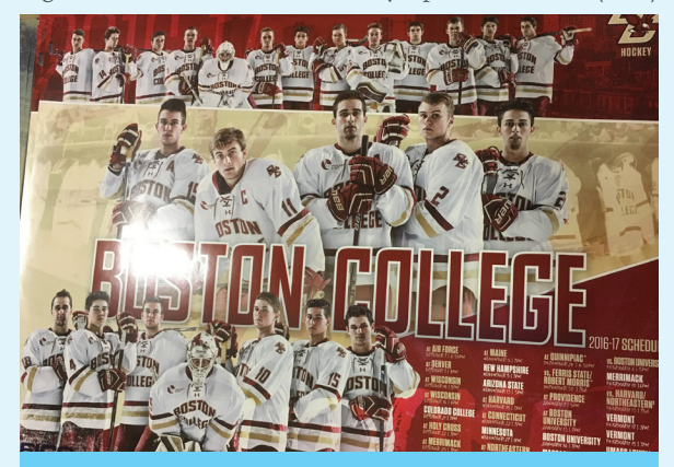
BOSTON COLLEGE MEN'S HOCKEY TEAM POSTER

Lucas and Smith (1978) also suggest ideas that can also be used to analyze these promotional posters. They discuss the women's anti-competitive movement as one of the initial programs that was against women's sports. The movement gained traction when they presented their original argument to the International Olympic Committee (IOC)