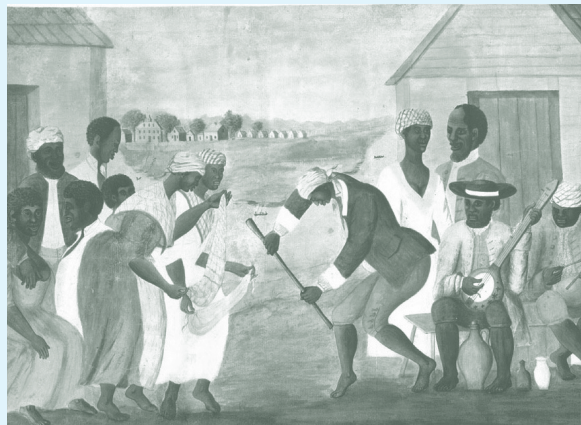
SLAVES DANCE TO THE MUSIC OF BANJO

Another way in which masters limited the ability of slaves to use their own culture was that before slaves could organize a dance, they would have to ask their masters for permission first. 63 On some plantations, there was a separate "house" that slaves held their dances in, 64 but on others, the dances seemed to take place near the slave quarters. 65 The inability to come together in their own quarters was particularly dehumanizing because it meant that slaves did not even have control over what activities went on in their homes.