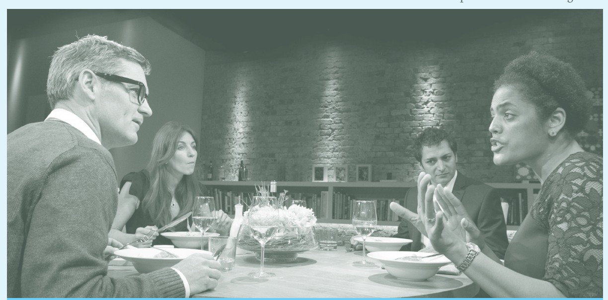
IMAGE FROM PERFORMANCE OF DISGRACED AT THE BUSH THEATRE

But Akhtar takes everything a step further. In one of the play's most harrowing scenes, Amir viciously beats his wife when he discovers her infidelity. He assaults her in a "torrent of rage"<sup>72</sup> until he realizes the inhumanity of his own actions; by the end of the scene, his wife's face is covered with blood. Amir's violence connects to his earlier comments about how Islam promotes wife-beating – the