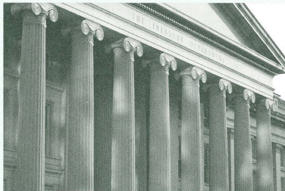
BLIPS, AMONG OTHER INNOVATIVE TAX SHELTERS, COST THE TREASURY $1.5 BILLION OF UNCOLLECTED REVENUE.

recent years, several landmark cases have altered the legal environment underlying tax shelter transactions. Judges in these cases have continually relied upon the equitable doctrine of “economic substance,” which was first utilized in the Supreme Court case of Gregory v. Helvering . xix In one such case, Long-Term Capital Holdings v. United States of America , xx a corporate taxpayer significantly reduced its tax liability through an outlandish financial arrangement. In the disputed transactions, the lessee, who was organized under British law, attained lease prepayments on subleases. These prepayments were then exchanged for preferred stock of several American corporations. After the lessee gave the preferred stock to certain taxpayers for a partnership interest and then sold its interest back to the taxpayers, the taxpayers sold a large portion of the contributed preferred stock to generate the supposed losses. The court decided that the business deal lacked economic substance and had no business purpose other than tax avoidance. Thus, it had to be set aside for tax purposes. Also importantly, the court imposed substantial fines on the corporation by assessing tax underpayment and gross valuation misstatement penalties. xxi