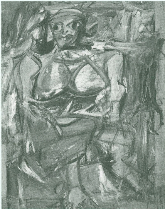
FIGURE 3. WILLEM DE KOONING, WOMAN I (1950-2).