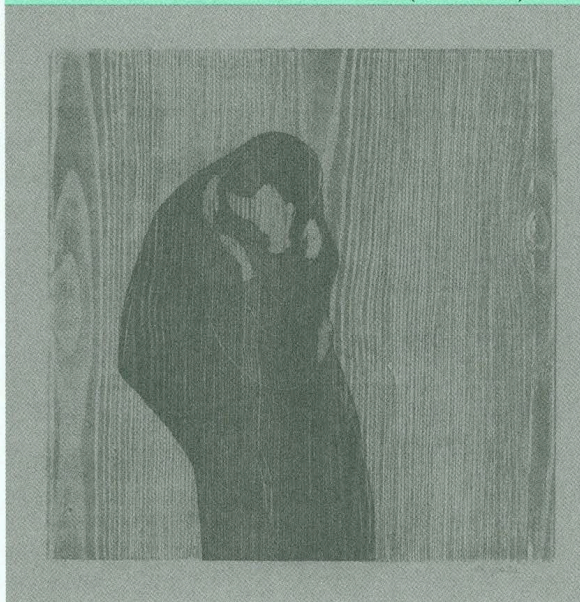
FIGURE 4. EDVARD MUNCH, KISS IV (1897-1902).

De Kooning’s Woman I is arguably less abstracted than the figures in Munch’s comparable image. De Kooning represented the looming eyes and the large, swelling breasts of the female figure, reminiscent of ancient goddesses of fertility, with simple ovals; the skirt, with swabs of red and ochre; and the legs, with flesh-toned rectangles. The gestural commotion around the torso is evocative of de Kooning’s pentimenti xxiv ; the need for abstraction attained via multiple campaigns attests to the “utter dependence on pigment as an expressive agency” and to the fact that the process of creating, destroying, and recreating reveals something fundamental about the artist.