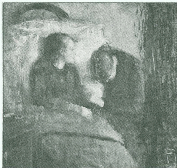
FIGURE 2. EDVARD MUNCH, THE SICK CHILD (1885-6).

tion, and the sensations conjured up by this reflection cause him to manipulate the medium, thereby distorting the features of nature, until he has fully conveyed what the original psychological experience inspired in him. Nearly ten years after the death of his sister Sophie, Munch painted The Sick Child (figure 2), a clear departure point for his mature works. He was continually disturbed by the memory of her suffering, perhaps by the horrific image of the coughing up of blood, and would even paint several versions of this work at later stages of his life. He commented, “When I saw the sick child for the first time—the pale head with the vividly red hair against the white pillow—it gave