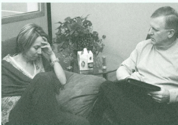
A WOMAN IN A PSYCHOTHERAPY SESSION, OFTEN THE FIRST STEP TOWARD SRS.

While SOC acknowledges that psychotherapy is not necessary in all cases, it is certainly highly recommended for patients who wish to undergo SRS in order to provide options and assess eligibility and readiness for the life adjustments involved in sex change. Psychotherapy also addresses the effects of GID on the patients' work, education, and family life. xvi There is no required number of sessions of psychotherapy because patients vary greatly in emotional state and psychological history, and SOC wishes to avoid patients seeing psychotherapy as simply a hurdle on their way towards their ultimate goal of SRS. xvii