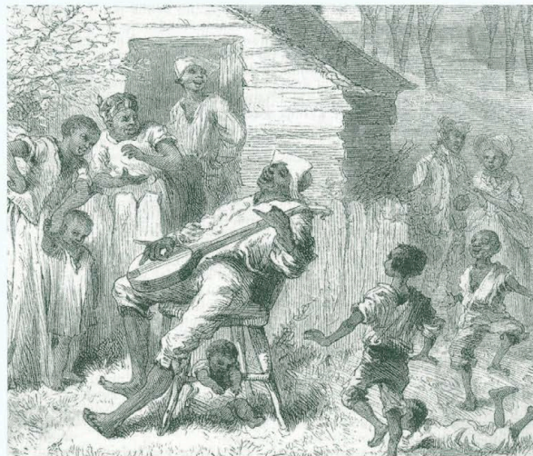
THE CALL-AND-RESPONSE WAS INTEGRAL TO THE FABRIC OF SLAVE SOCIETY.

This article argues that the call-and-response in modern hip-hop and rap is just as culturally and linguistically significant as the above examples in continuing the development of community and identity. The call-and-response in one specific song, Usher's "Love in This Club," contains evidence for this interpretation. Examining this song develops a more universal understanding of the call-and-re-