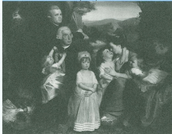
FIGURE 4. JOHN SINGLETON COPLEY, THE COPLEY FAMILY (1776)