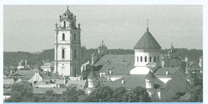
MANY CITIZENS OF VILNIUS, LITHUANIA WERE DEPORTED TO SIBERIA AND SOVIET ASIA.

Ironically, however, because of the general repression and terror of the deportation experiences, and the fact that the victims were often suggested at random, as available evidence suggests, lxxii the aim of the brutal Soviet repressions failed at-large to achieve their goal. Further still, the purges