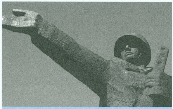
SOVIETS ATTEMPTED TO POPULARIZE COMMUNISM, SUCH AS WITH THIS STATUE IN RIGA, LATVIA.

the Communist parties were legalized in each country, while former ruling parties were banned, effectively creating one-party systems; non-Communists were banned by July, 1940 from Baltic governments, and the majority of cabinets were Communist. That same month, two waves of mass arrests removed uncooperative elites from the Baltic political scene. Then, elections were held and the poll results were doctored to Soviet desires when needed. The newly elected People's Diets convened in July and formally requested admittance into the USSR as SSRs; and finally, by August, 1940, Moscow approved the Diets' requests, creating Estonian, Latvian, and Lithuanian republics within the Soviet Union. XIVI