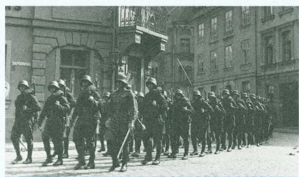
FOLLOWING WORLD WAR I, LATVIA WAS AN INDEPENDENT STATE WITH ITS OWN STANDING ARMY.

Latvia's emergence as an independent country in 1918 was a defining national and, in some ways, ethno-national moment for the Latvian peoples.iii At the conception of the Latvian state, the Latvians were already well-acknowledged and documented as being an ancient people with a unique. Baltic, Indo-European language. But while the Lithuanians had, at one point in history, established an empire in Eastern Europe in conjunction with Poland, the Latvians had never before been united as an independent political entity. iv And thus, the year 1918 saw the inception of the First Latvian Republic. V Concurrently, Estonia had come from different historical, linguistic, and cultural ties which were largely connected with Finland and thus had different experiences from the other Baltic countries.vi Estonia emerged following the upheavals of the First World War, the collapse of tsarist Russia, and the defeat of Imperial Germany, as a modern, unicamerally legislated, liberal Estonian nation.vii