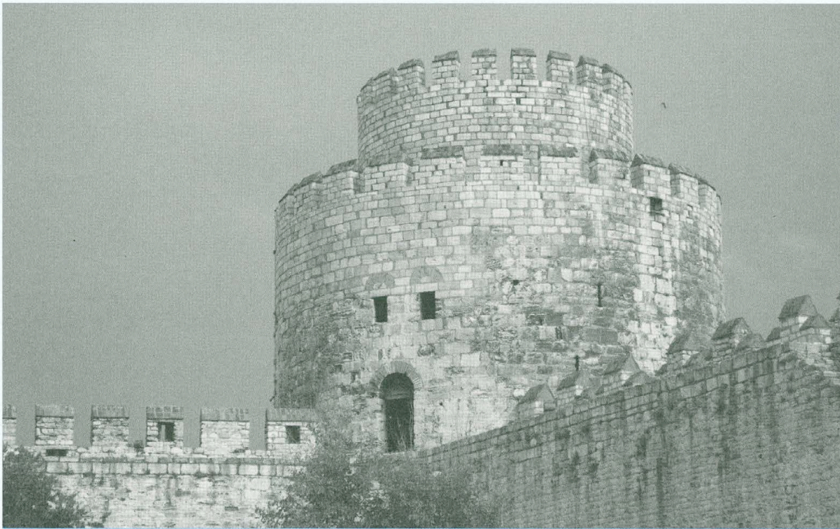
AN OUTMODED TURKISH FORTRESS

consumes a great amount of powder, besides cracking and breaking the wheels and the carriages and even the ramparts on which it is placed....Our artillery is more handy to move and more efficient and here resides our advantage over the cannon of the Turks. xxiii