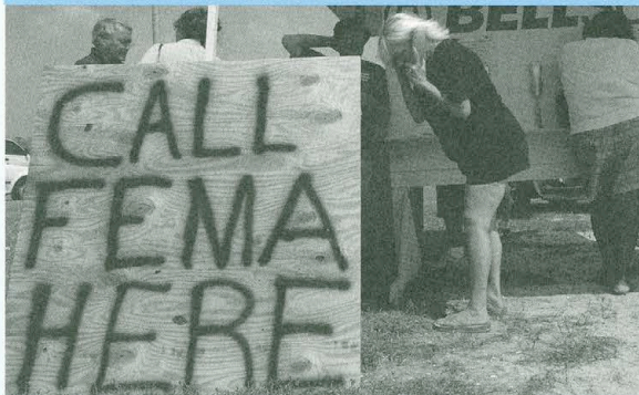
VICTIMS OF HURRICANE KATRINA DESPERATELY SEEK ASSISTANCE FROM THE SEEMINGLY ABSENT FEMA.