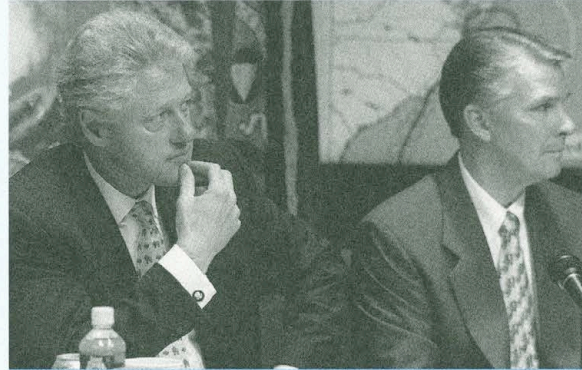
PRESIDENT CLINTON AND JAMES LEE WITT ANTICIPATE HURRICANE FLOYD.

Known to many as “the disaster after the disaster,” FEMA's reputation was that it “would lumber in after a catastrophe, and anger local officials with its ineptitude.” iv FEMA lived up to its reputation most egregiously after Hurricane Andrew struck southern Florida, causing the agency to