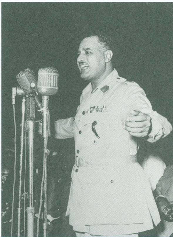
GAMAL ABDEL NASSER

to placate the IMF, which was demanding that Egypt balance its budget as part of its debt relief program. After seeing the uproar created by the subsidy decreases, Sadat knew he would not be able to reduce the subsidies and remain in power; thus, he sought another way of decreasing budgetary strains. There was one other path to take to balance the budget, and it required two actions: 1) to increase sources of income, mainly through foreign aid and FDI; and 2) to decrease military spending. Both objectives required peace with Israel.