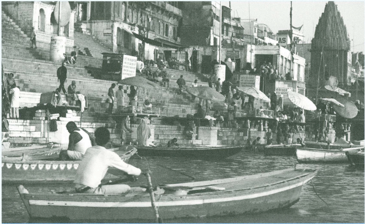
OFFERING ON THE GANGES, VARANASI, INDIA

may stem from such dialogue. If Christians profess Jesus Christ's ability to be within the other (an idea manifested within Matthew 25:31-46), Advaita Vedanta can reverse the concept (as in a notion of "Christ within"). Devotion to God within, as is found in the path of knowledge, brings Christians back to the awareness of Christ within themselves. By studying and dialoguing with Jñana-Hindus, Christians can come to a deeper understanding of teachings of their participation in Christ's body.