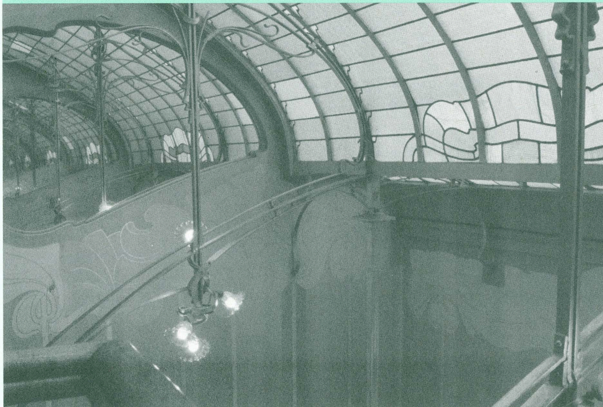
CLASS DOME OVER THE HOUSE VICTOR HORTA BUILT FOR HIMSELF AT 25 RUE AMERICAINE, BRUSSELS, 1898.

The column in the front hall supporting the second story is especially representative of Horta's blending of the functional and the aesthetic. It is a necessary element to support the building, but it is a piece of art in itself. The capi-