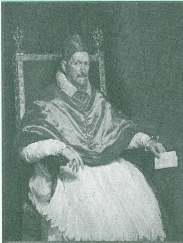
PORTRAIT OF POPE INNOCENT X, DEPICTING THE BROTHER-IN-LAW OF DONNA OLIMPIA.

“Donna Olimpia may have identified with the story of Erminia, since both the poem and the painting advocate female empowerment according to her beliefs and tastes.”