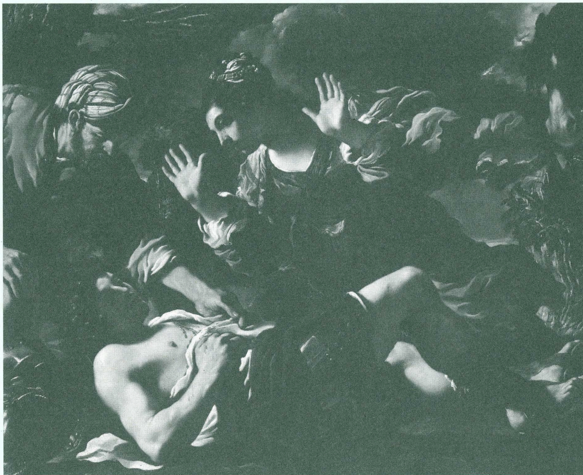
ERMINIA FINDS THE WOUNDED TANCREDO BY GIOVANNI FRANCESCO GUERCINO.

was resented in a papal government that was “by definition restricted to celibate male ecclesiastics.” 16 Her influential position in the papal court is reinforced in the renovated Palazzo Pamphilj on the Piazza Navona, which was constructed under her direction between 1644 and 1650. 17 The new palace “provided her with a suitable setting for her central role in the Pamphilj pontificate and aggrandized her presence to visitors.” 18 She exalted herself using painted imagery in the chambers of the piano nobile, which references her both indirectly and directly. These allusions to her underscore her preeminent position in the palace. 19 If callers were not previously aware of Donna Olimpia’s stature before they entered the palace, they cer-