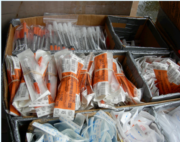
CLEAN HYPODERMIC NEEDLES AND SUPPLIES FOR INJECTION

In this country alone, approximately 800,000 individuals aged 13 or older inject drugs each year. 2 These intravenous drug users (IDUs) are at high risk of HIV infection, as injection is a major route of transmission of the disease. In fact, about 7% of the estimated 47,352 diagnoses of HIV in 2013 were attributed to intravenous drug use, with an additional 3% attributed to a combination of male-to-male sexual contact and IDU. 3 In Philadelphia, the rates of infection via injection are similar to those of the nation, with 7.7% of AIDS cases and 4.4% of HIV cases diagnosed in 2013 resulting from infected needle sharing. 4 As an urban