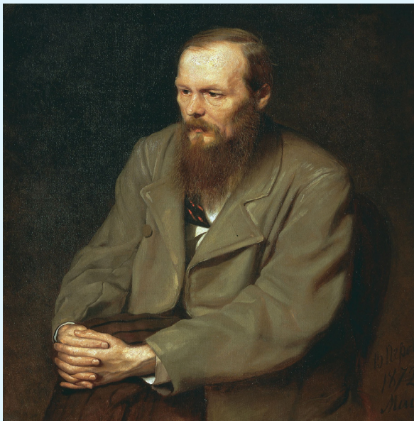
PORTRAIT OF THE AUTHOR, FYODOR DOSTOEVSKY, IN 1872

The dualistic culture that Dostoevsky immersed himself in was integral to his inspiration to construct a trial of his own in The Brothers Karamazov . Especially during the end of his life, Dostoevsky was "very much rooted in his time... he was deeply preoccupied with events taking place in both