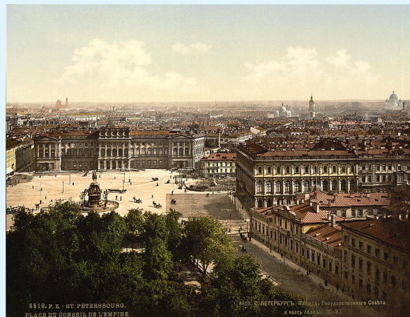
THE IMPERIAL COUNCIL, WEST SIDE, ST. PETERSBURG, THE BIRTHPLACE OF DOSTOEVSKY

Dostoevsky also emphasizes the unreliability of evidence in the courtroom with the introduction of dubious expert witnesses on both sides of the trial. For example, the Moscow doctor who testifies to Dmitri’s temporary insanity without ever meeting him only does so at the behest of Katerina—not even the defense attorney supports this testimony. Dostoevsky satirizes the employment of pseudoscience in the courtroom to prove that expert witnesses are, more often than not, “bought or subjective.” 48 The experts contradict one another, and the doctor from Moscow and Doctor Herzenstube take the case to pursue their personal vendettas against each other, overall making “the expert testimony appear ludicrous.” 49 The fact that evidence can be misconstrued to deny the truth and the fact that evidence is essential to proving the truth indicates Dostoevsky’s belief that “evidence...is a knife (literally “a stick with two ends”) that can cut either way...the one small truth on which larger truths hinge.” 50