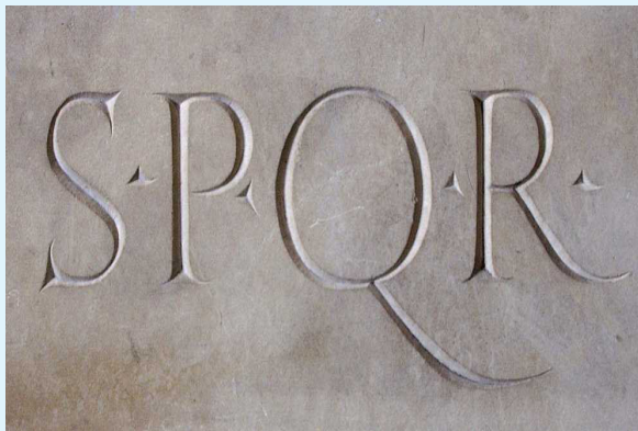
INITIALS OF THE LATIN PHRASE SENATUS POPULUSQUE ROMANUS (“THE SENATE AND PEOPLE OF ROME”)

The combination of the above analysis suggests a fairly clear interpretation of how Cicero viewed Roman cultural identity. We have already seen that Cicero firmly believes the artes and humanitas are not only related, but share a unique bond that informs the role of citizen in a special way. This bond creates a bridge between the artes of Greece and Rome, and the modern scholar, who reads and thinks about these influential works to cultivate a moral understanding of the world. More specifically, Cicero highlights the virtues of honor and glory that a Roman can learn from these artes , which are now a part of humanitas , and drives a man toward certain goals, even in the face of adversity. Finally, it is the daily and lifelong pursuit of these noble virtues through a broader education, combined with public works or office, which makes someone truly Roman. An important caveat involves what kind of person Cicero ultimately considers to be worthy, or even capable, of embodying Roman status. Cicero seems to apply a certain type of classism in deciding who can be considered