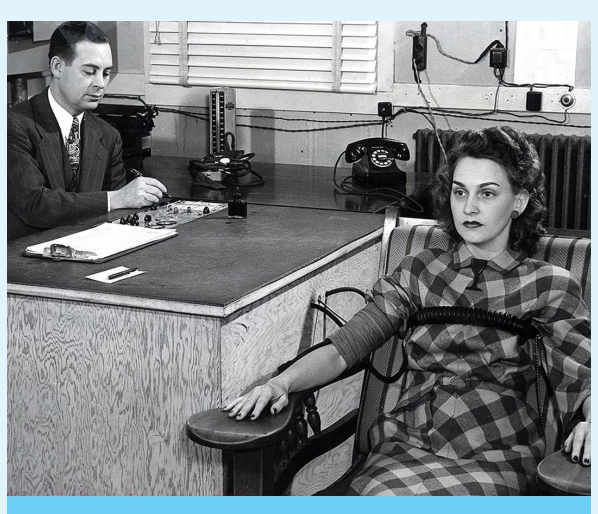
A DEMONSTRATION OF A LIE DETECTOR TEST