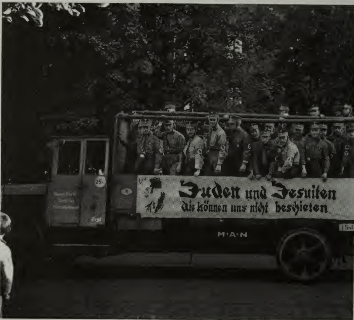
Nazi Storm Troopers on the back of a truck with a banner that reads "Juden und Jesuiten die koennen uns nicht beschieten" (Jews and Jesuits cannot cheat us)