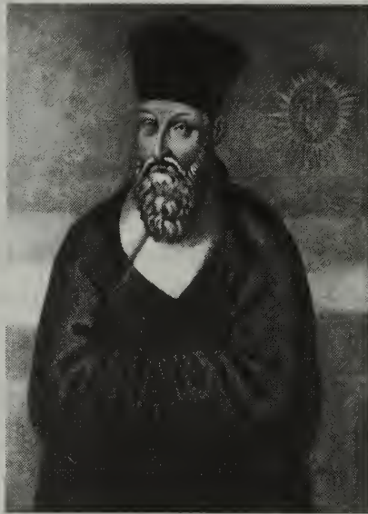
Matteo Ricci, S.J. (1552 - 1610)

ory and his grave in Beijing is still a place of pilgrimage. 21 As is widely known, he eventually adapted his manner of dress to that of the mandarin class, and his modus operandi of discussing mathematical and scientific matters first and only afterwards raising issues of religion (as noted earlier) shows a very concrete way of following Ignatius's counsel of "entering by their door."