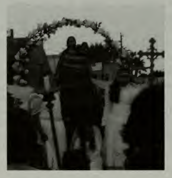
Loreto, Baja California