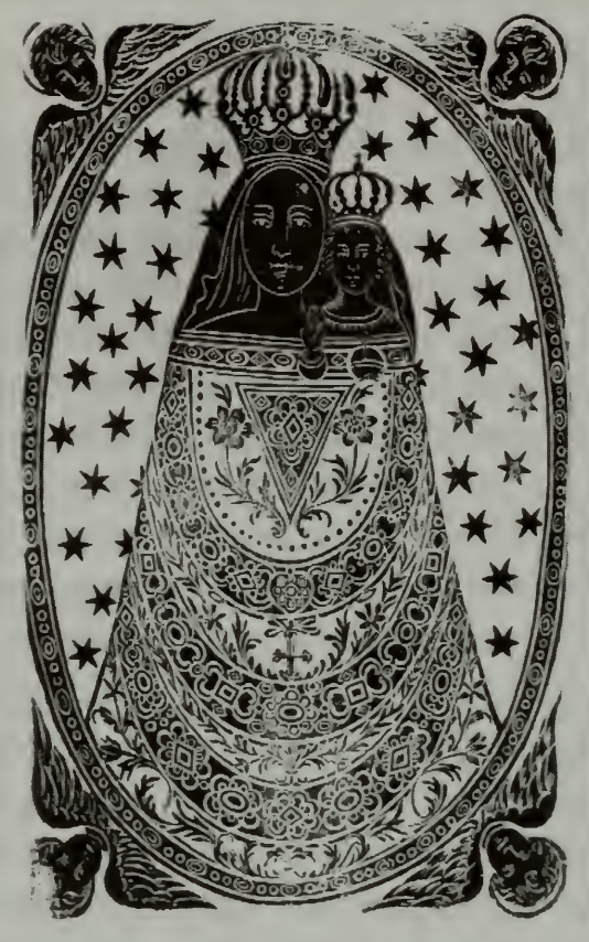
Sixteenth-century Woodcut, Our Lady of Loreto