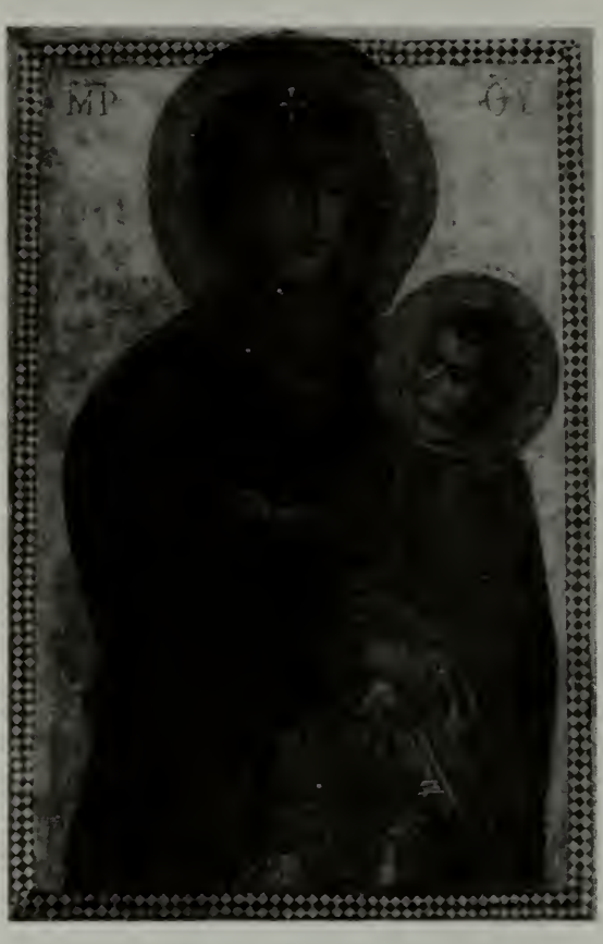
Byzantine Icon, Salus Populi, Rome