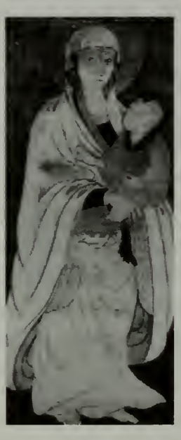
Chinese Salus Populi (Field Museum)