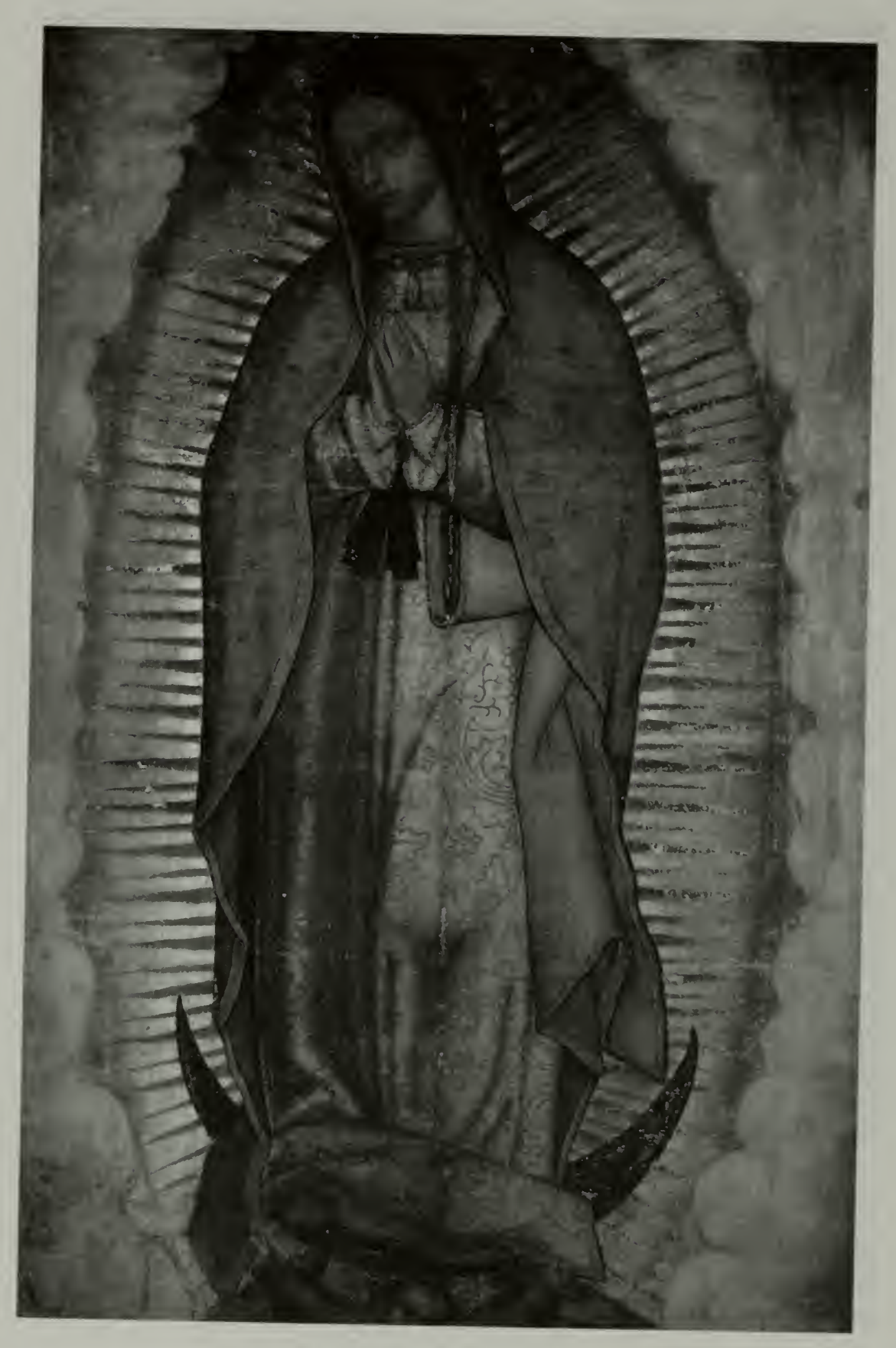
Our Lady of Guadalupe