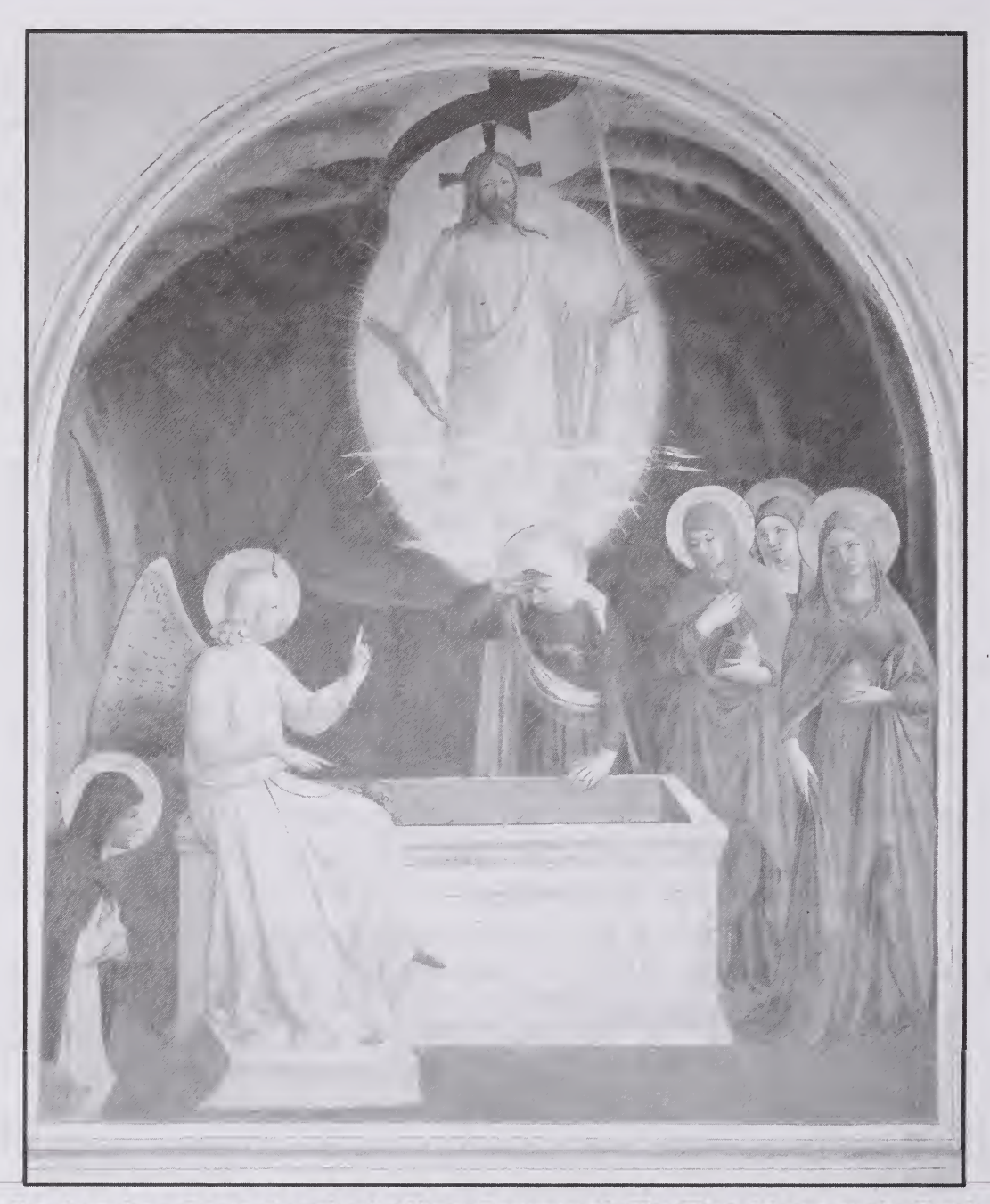
Fra Angelico (Beato Angelico) Christ Resurrected: The Three Marys at the Tomb 1438. Mural, 181 x 151 cm.